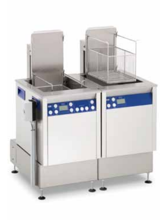
Manual 2-chamber system with oscillation device