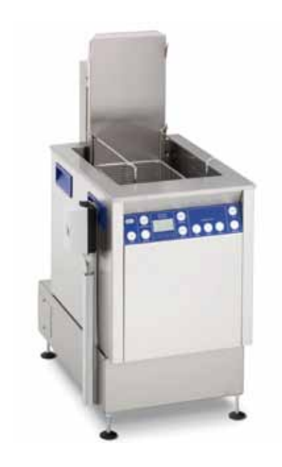
Single unit with oscillation device