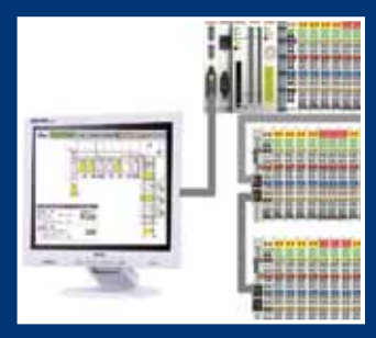
Operating panel designed as touch panel